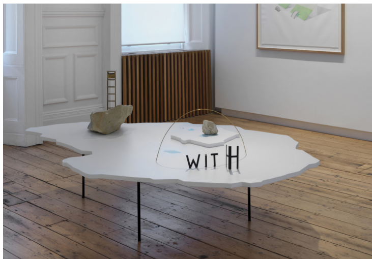
FIG. 4 Installation view of On a Rock, a Brief Circle of Sun at Selma Feriani Gallery, London, 2023, showing Even distances are continents , by Massinissa Selmani. 2022. Wood, stones, copper, coloured pencil on transparent polyester paper, photocopy and metal, dimensions variable. (© Massinissa Selmani and ADAGP, Paris; courtesy the artist and Selma Feriani Gallery, London and Tunis).

Shadows play a defining role in Selmani's images. Although ephemeral and immaterial themselves, they give substance to depicted phenomena and mark the passage of time. In drawings where spare delineation is the means of representing people and things, a lightly drawn shadow is often deployed to anchor an object, conjuring three-dimensional space without superfluous elaboration. In Une profondeur de ciel et de chemins #3 FIG. 1, for example, shadows are distinctly present under the bridge and flag, but also the rock, which is a mere outline, transparent against the grass and yet grounded by a solid patch of shade.