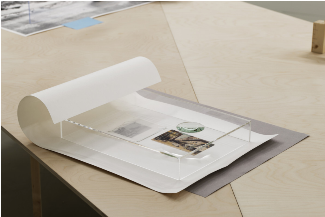
FIG. 13 Installation view of Ce qui coule n'a pas de fin ( That which flows has no end), SAM Art Projects Prize, at Palais de Tokyo, Paris, 2018.