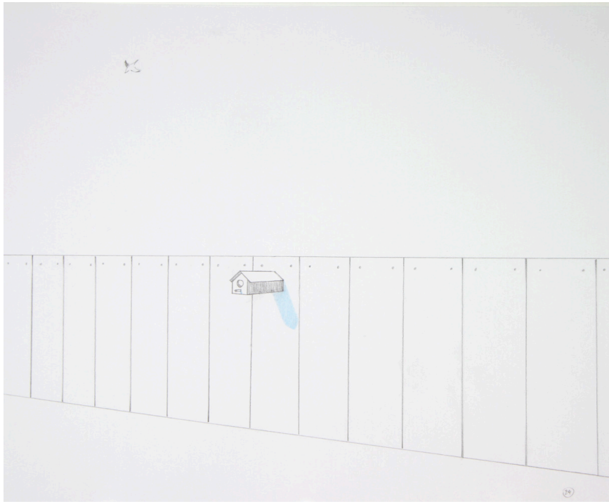
FIG. 5 Still from Perspective , by Massinissa Selmani. 2022. Looped animation. (© Massinissa Selmani and ADAGP, Paris; courtesy the artist, Selma Feriani Gallery, London and Tunis, and Galerie Anne-Sarah Bénichou, Paris).

Selmani's absurdist humour is particularly evident in his looped animations, in which a single action is gently repeated in a perpetual cycle of quiet futility: a bird flies into a birdhouse fixed to a wooden fence, before emerging from the back and re-circling FIG. 5 FIG. 6; the shadows of a plane and a maple tree intersect as the plane flies overhead FIG. 7; a man in a pit holds up a microphone to a giant on-screen image of a uniformed general, who repeatedly raises and lowers his hands FIG. 8. These hand-drawn, silent, stop-frame animations are deliberately primitive, recalling the action of flicker books. The artist's delight in graphic games of illusionism can be traced back to his early love of cartoons, most notably The New Yorker's illustrator Saul Steinberg and his paradoxical play with pictorial space. That Selmani remains committed to the humble media of pencil on paper or tracing paper may be taken as evidence of his allegiance to such graphic traditions, the succinctness of which he takes to new heights of philosophical and political acuity. He can say everything he needs to say with these simple tools and the empty expanse of paper is the firm ground on which any edifice can be built. The precision with which he constructs his images, his paring down of each motif to the minimum, gives them a clarity and resonance that exceed their modest size and seeming reticence. They are as concise and exactly placed as a poem on the page.