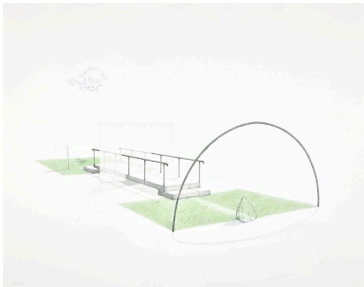
FIG. 1 Une profondeur de ciel et de chemins #3 (A depth of sky and paths #3), by Massinissa Selmani. 2022. Graphite and coloured pencil on paper, 55 by 70 cm. © Massinissa Selmani and ADAGP, Paris; courtesy the artist and Selma Feriani Gallery, London and Tunis).

The nomination of the Algerian artist Massinissa Selmani (b.1980) for the Prix Marcel Duchamp 2023 is an acknowledgment that a practice primarily grounded in pencil on paper can constitute a major contribution to contemporary art. 1 In Selmani's abbreviated aesthetic, substantial ideas are carried by the barest of means: a few cursory lines denoting a cloud, the outline of a figure carrying a blank flag, a portion of a monumental statue held aloft by a fluttering bird, a section of a miniature barrier embedded in a rock. Encompassing drawing, animation and sculpture, Selmani's practice is characterised by a quiet uncertainty. His finely measured pencil-drawn images float on an empty expanse of white paper, usually with no hint of a setting in a particular location; they exist outside historical time and geographical space, and yet those constraining conditions of human life are precisely their subject.