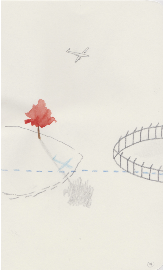
FIG. 7 Still from Traversée , by Massinissa Selmani. 2020. Animation projected on agenda page, wood, paper and photocopy. (© Massinissa Selmani and ADAGP, Paris; courtesy the artist, Selma Feriani Gallery, London and Tunis, and Galerie Anne-Sarah Bénichou, Paris).

Many of Selmani's images are derived from documentary sources, situating them decisively in the realm of fact and everyday, lived reality. He traces the outlines of figures from newspaper photos, extracting from their context and the captions that would explain their actions. Nevertheless, they retain their potency as evocations of human effort, struggle or resistance. Yet they are disconcertingly ambiguous and elusive. The artist cites as a source of inspiration the Belgian surrealist poet Paul Nougé who, in a series of enigmatic photographs taken in 1930, represented mysterious actions: 'actions carried out on an object' by the 'suppression' or 'modification' of that object, for example two men mimicking the gesture of clinking glasses but with their hands empty, or a group of people gathered in a room staring transfixed at a blank wall. 3 Similarly, Selmani's elimination of elements that would make sense of an image renders the familiar strange and mundane actions inexplicable.