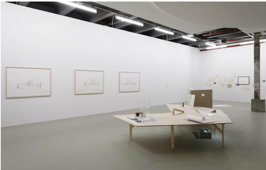
FIG. 12 Installation view of Ce qui coule n'a pas de fin ( That which flows has no end ), SAM Art Projects Prize, at Palais de Tokyo, Paris, 2018.