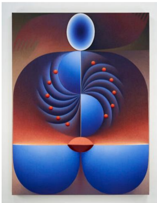
Loie Hollowell, Red Hole, 2019, oil, acrylic medium, and high density foam on linen over panel, 72-1/8" x 54" x 3-1/4" (183.2 cm x 137.2 cm x 8.3 cm), #72774 Format of original photography: digital