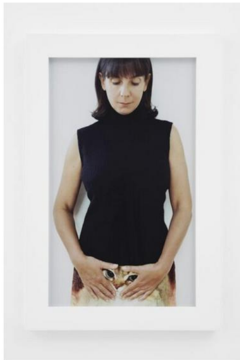
Artwork by Sophie Calle