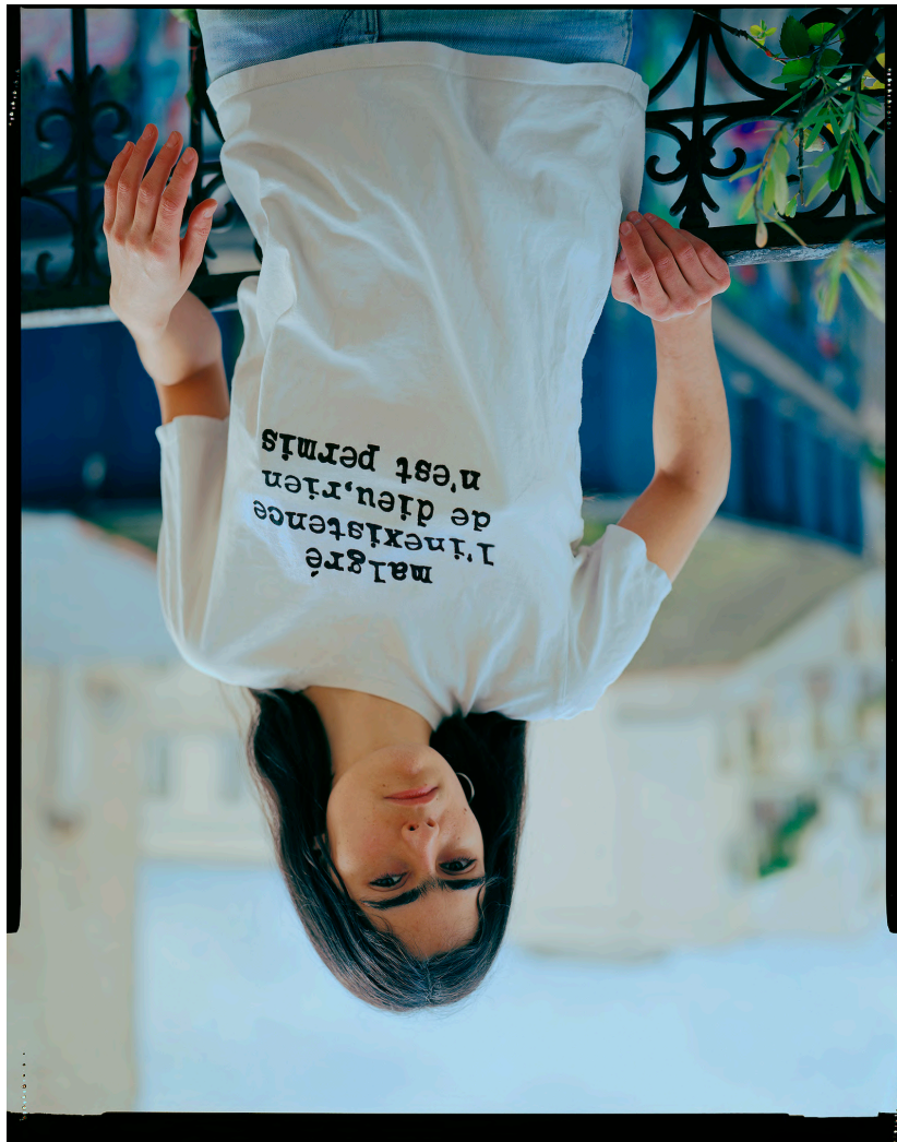
Malgré l'existence de dieu, rien n'est permis , 2024, photography, pigment print on FineArt Baryta Hahnemühle, 130 x 105 cm

The exhibition's layout is designed in resonance with the artist's upcoming exhibition at the Rencontres de la Photographie d'Arles, to be presented from July 1, 2024, at the École Nationale Supérieure de la Photographie.