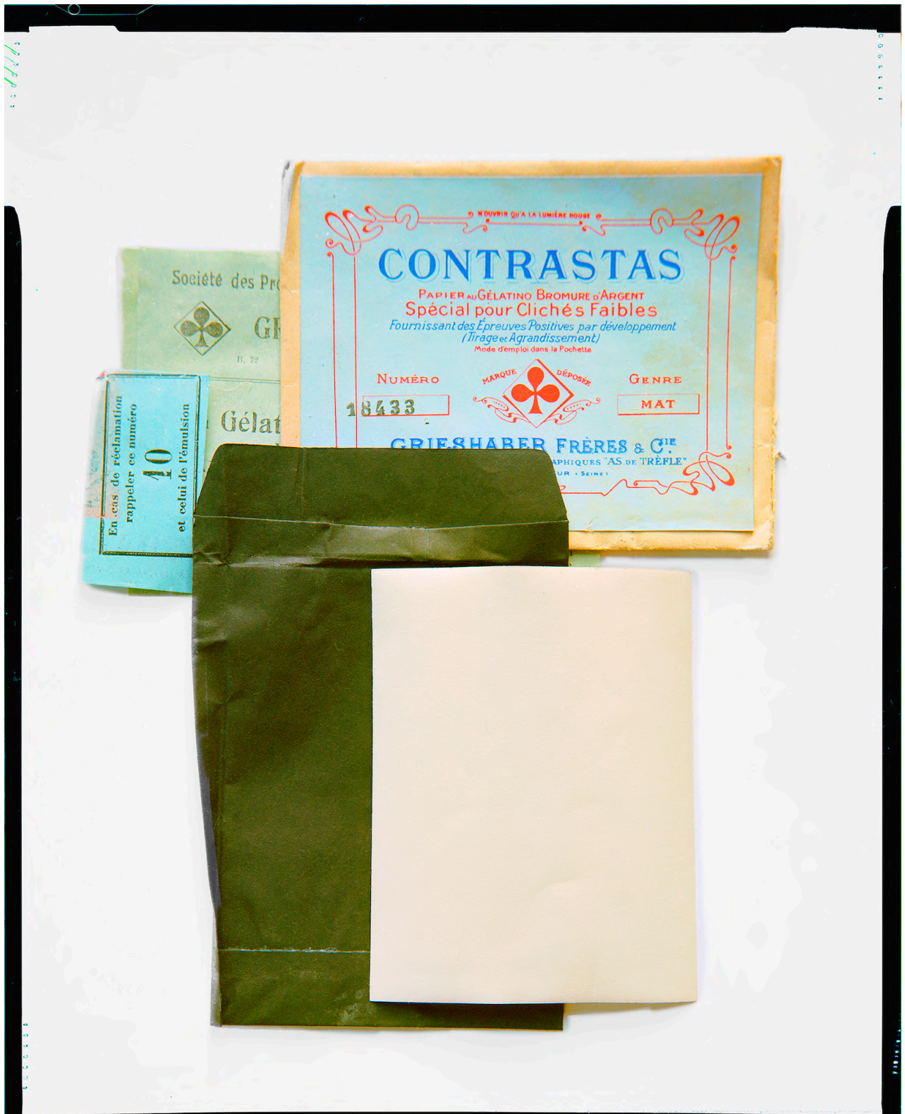
Papier insolé Contrastas, 2024, photography, pigment print on FineArt Baryta Hahnemühle, 130 x 105 cm courtesy de l'artiste et de la galerie Anne-Sarah Bénichou