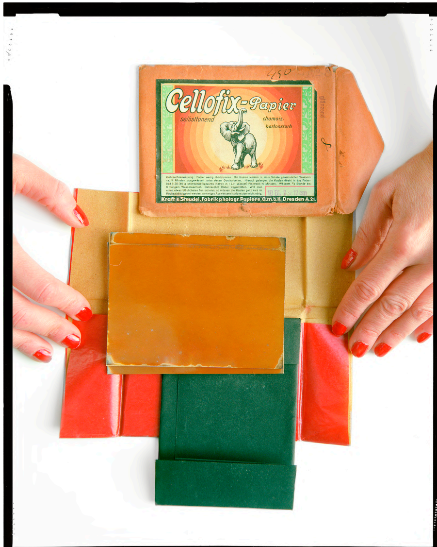
Papier insolé Elephants , 2024, photography, pigment print on FineArt Baryta Hahnemühle, 130 x 105 cm

Laurent Montaron's exhibition, by tracing a genealogy of our rational thought ( Ciel d'Élée, Malgré l'inexistence de dieu ) and traversing the technologies of photography and cinema ( Papiers Insolés, Ektachrome, Kodak Yellow, Voice of Theater ), invites us to reflect on the modes of transmission of our experience of the world, putting into perspective the role of narratives, including in the pursuit of an objective description of reality.