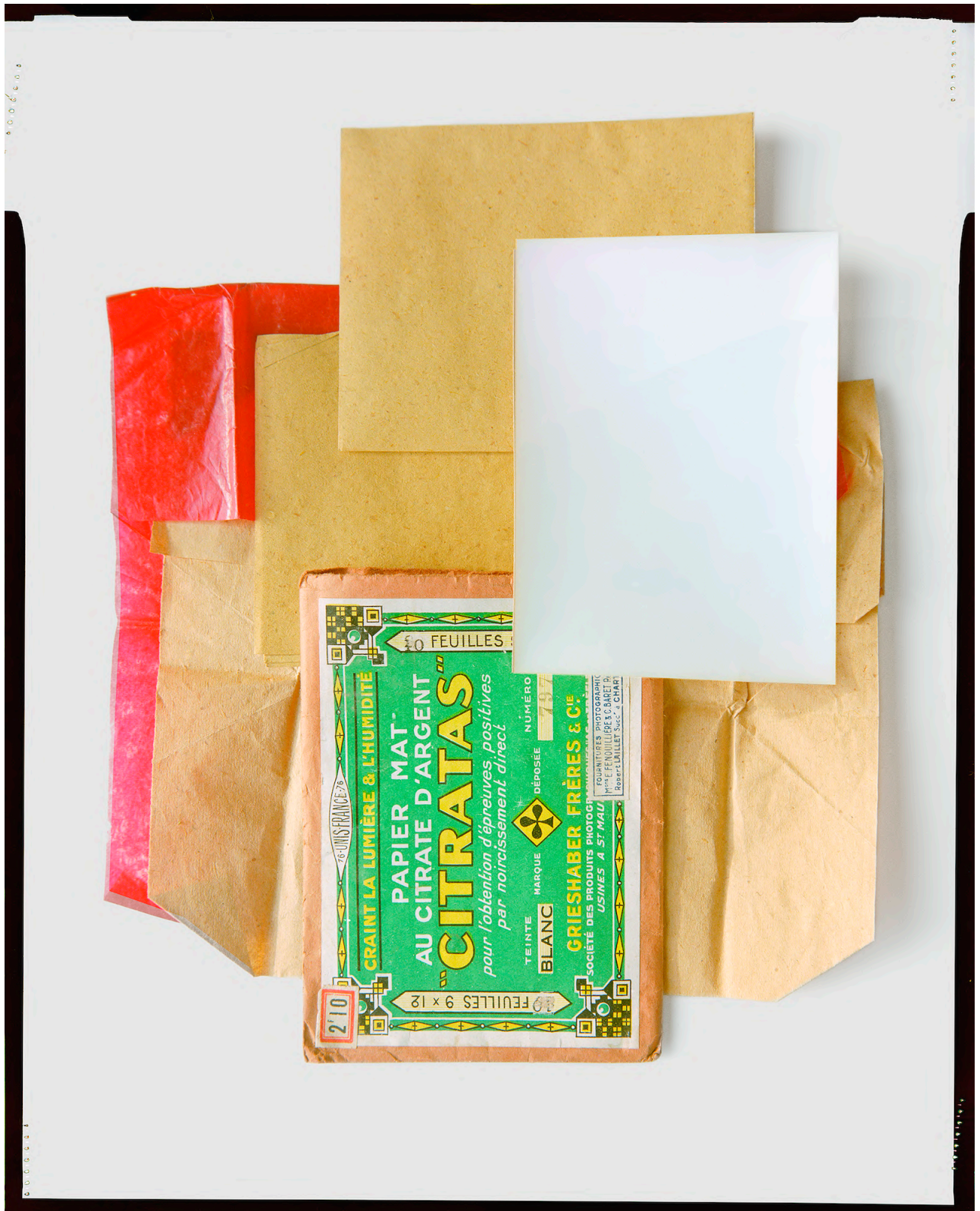
Papier insolé Citratas , 2024, photography, pigment print on FineArt Baryta Hahnemühle, 130 x 105 cm