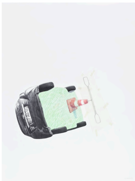
Après l'ordinaire #1, 2021, Coloured pencil on photocopy, Graphite and coloured pencils on tracing paper, adhesive, 50 x 38,5 cm