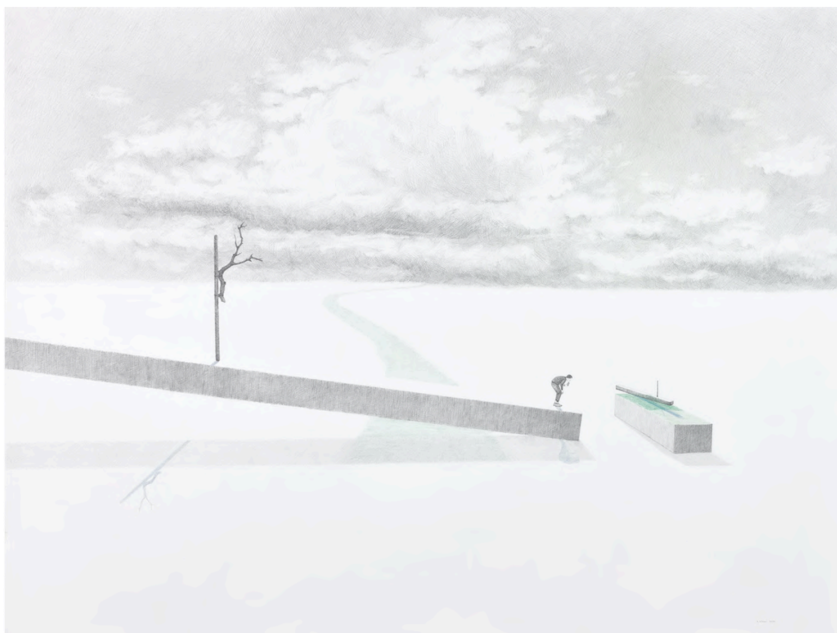
L'aube insondable #4 , 2020, Graphite and coloured pencil on paper, 75 x 100 cm