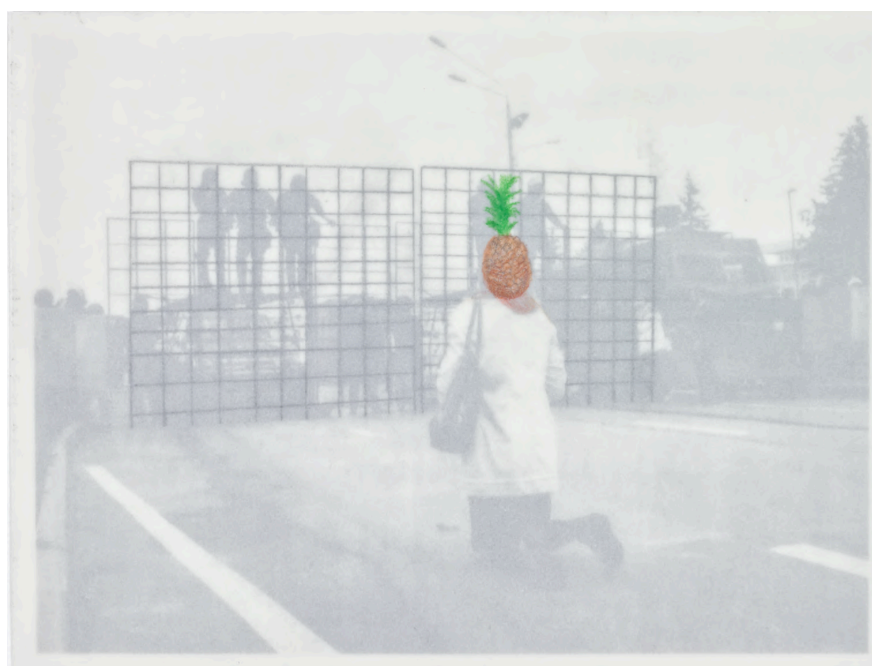
Untitled #7 , 2021 (Altérables), Photocopy, graphite and colour pencils on tracing paper, 15,5 x 19,8 cm