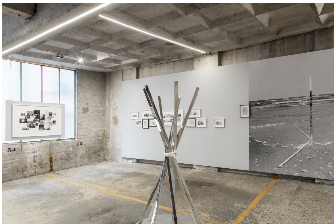
OFFSCREEN 2024 Stand E.09 - étage 2A Decebal Scriba