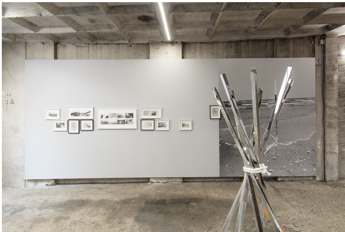
OFFSCREEN 2024 Stand E.09 - étage 2A Decebal Scriba